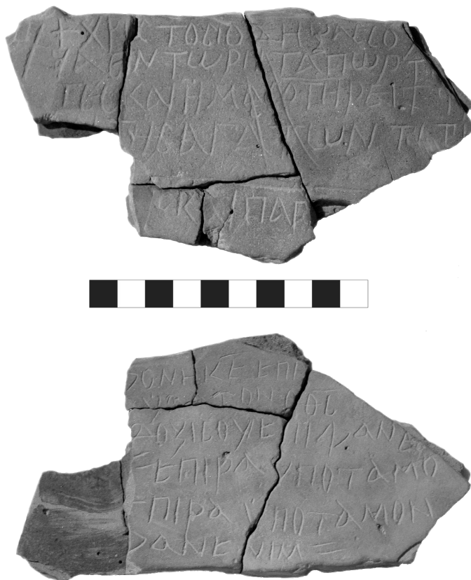
Fig. 3. SMN 23165: Foundation deposit (?) inscription on mud (text on both sides) from Akasha

The preserved fragment reads: P (horizontal line), Λ (corner), O (vertical line). At least another letter can be discerned under O .