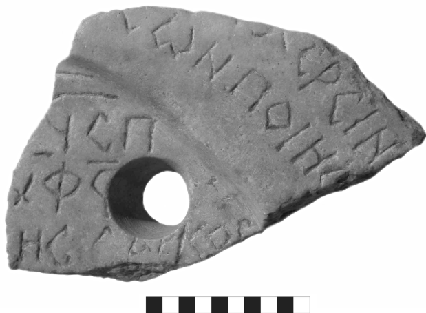
Fig. 5. SMN 32120: Fragment of a re-used inscribed round marble stela from Old Dongola

diameter). Fragments of two parts of what seems to be the same inscription are preserved. The first one occupies the raised border of the main epigraphic field in the center. On this border there must have been a text running in two lines. The preserved part reads: