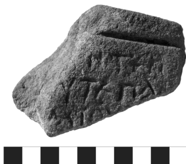
Fig. 2. SNM 18386: Fragment of sandstone tombstone from Semna, inscribed with a common Coptic text

16) SNM 18386 (fig. 2) is a more interesting fragment (11 x 9 x 3.5 cm), since it contains the first three lines of a recognizable prayer in Coptic: